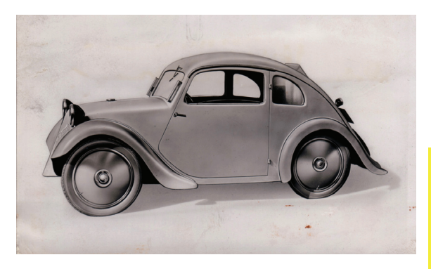
Striking resemblance between Josef Ganz's Standard Superior (above) and Hitler's VW Beetle (below).